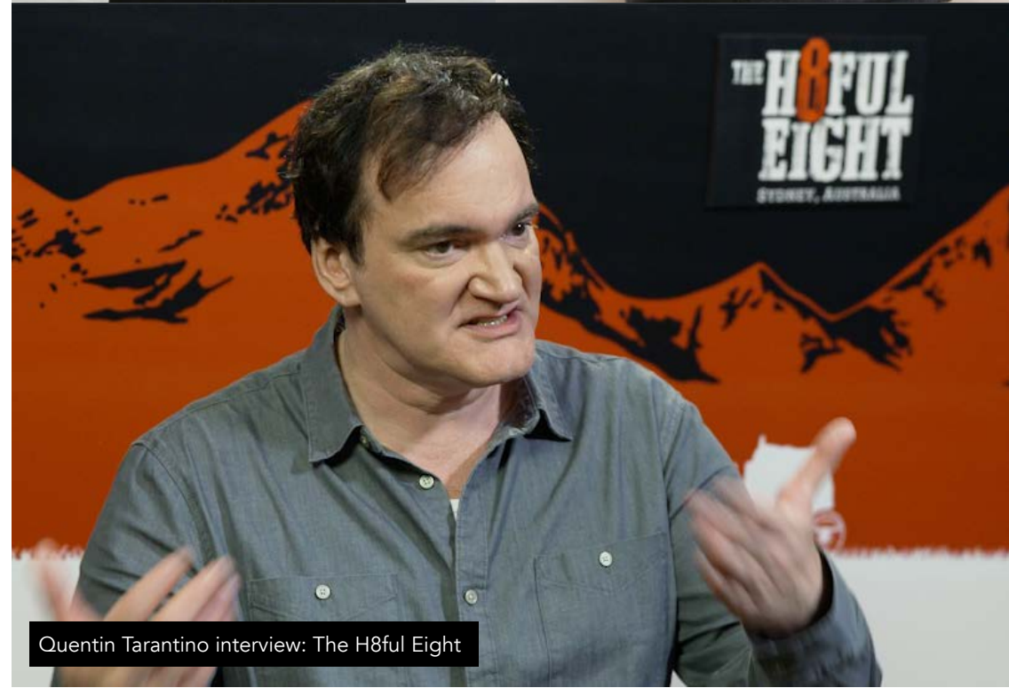
Quentin Tarantino interview: The H8ful Eight